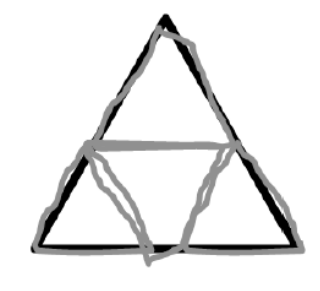
I used \forall shapes.