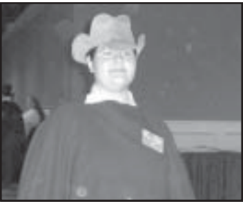
PAGE 3 Library Club stays active