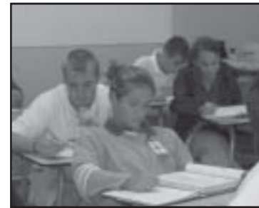
PAGE 6 Math students work hard to prepare for testing.